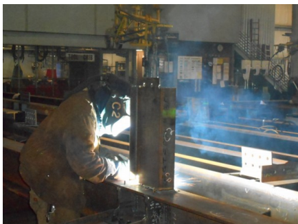
Gayle Manufacturing used a TRI to move its headquarters from California to Caldwell where it will create 70 new jobs.