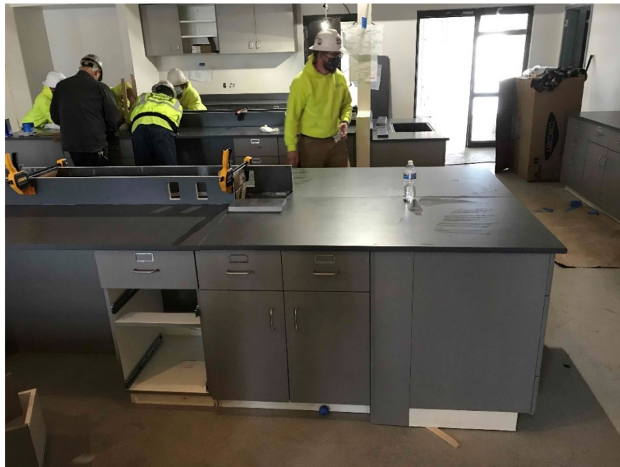
Figure 1. Laboratory countertops were the only critical path item delayed by the COVID-19 pandemic to date. They were recently installed supporting the near completion of Project Group E Phase 2 activities

The contractor, city staff, construction manager, and architect have coordinated successfully throughout the project to keep the project on schedule and under budget through demolition, construction, shutdowns, tie-ins, and switchovers without any significant impacts to WWTP operations.